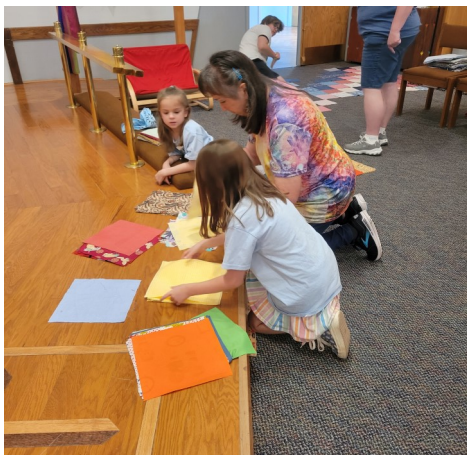
Girl Scouts- Camp Smitty 2024 at All Saints. The girl scouts did a quilting project with the quilting group.