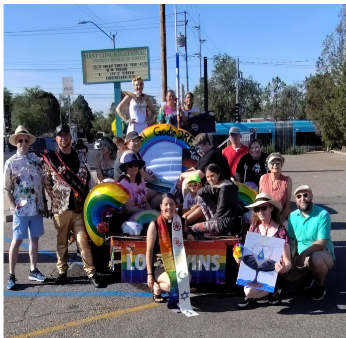
Pride Parade 2024