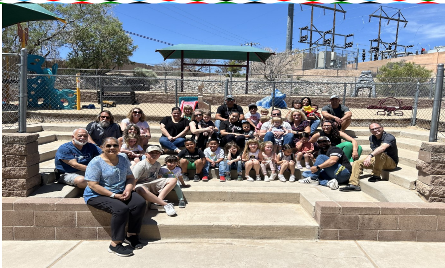
End of 23/24 school year. Picnic with families and children.

Summer session starts June 3, Monday through Friday, 8 a.m. to 4 p.m.