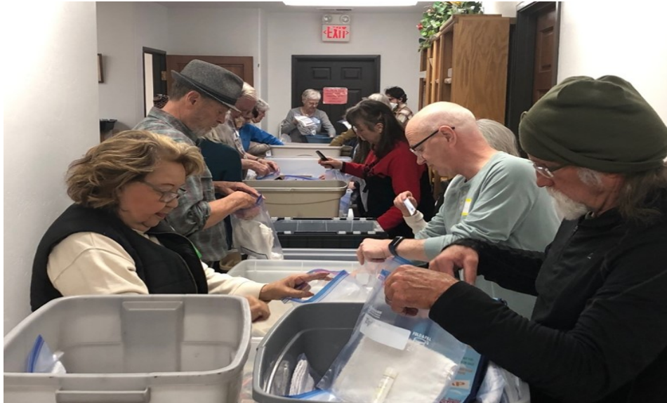
DIGNITY KIT ASSEMBLY LINE

contributing heavily to the United States economy by addressing the labor shortage in industries such as agriculture, healthcare, and hospitality. Allowing people who are not looking for a handout and want to work, the opportunity to fill vacant job openings makes sense to us.